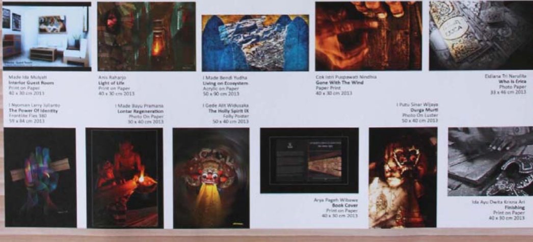
Made Ida Michell Interior Guest Room Print on Paper 40 x 30 cm 2013