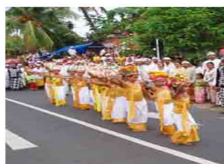
Figure 3 Rejang Renteng Dance