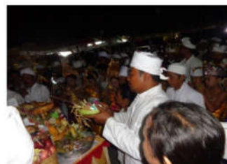
Figure 1 Stakeholder leads the ceremony