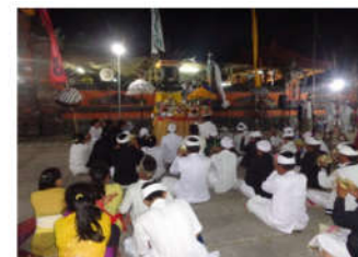
Figure 2 Dancer Sanctification in Dalem Temple

After praying together is done, then Rejang Renteng Dance is shown with the performance structures as follows.