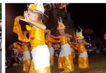
Figure 4. Dancers surround pelelinggih

Second , after turning around for three time, the dancers are in front of pelelinggih of Manik Ceraki Dance to natab banten pajegan led by Jero Mangku of Dalem Temple. Jero Mangku